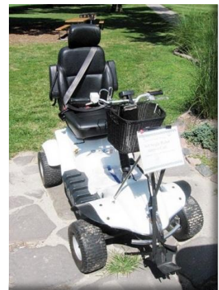
Adaptive golf carts